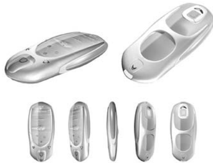
Figure 2: Concept of a mobile communication device (design Sonny Lim). The device allows the user to store and share pieces of digital information (memes).