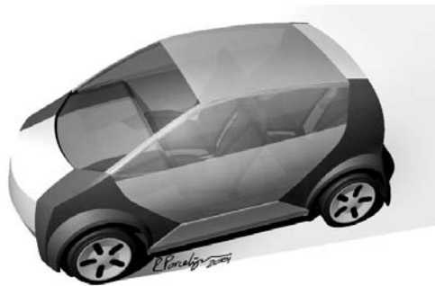
Figure 4: DutchEVO, a sustainable concept car for urban areas (design Rick Porcelijn)

These three factors were brought down to one general position. As a reaction to these factors, it was decided that we need space and freedom to experience our surroundings fully and express ourselves in an unforced manner. This statement was translated into a 'low threshold' concept car with a number of distinctive features (Figure 4). The car only minimally protects you from outside conditions, like wind, temperature, and noise, by using very thin and light materials. The car has a Catamaran-like structure that makes the floor situated at the top level of the tires. This affords a natural, step height way of entering the vehicle and the performance on side impact is impressive, i.e. the car has an outstanding passive safety. Both to compensate for the large frontal plane that would result from the relatively high floor level and to make the car as aerodynamic as possible, the car is fitted with a Venturi, allowing the wind to flow under the car without turbulences. The interior of the car is reduced to its bare essentials, thereby avoiding users to process information that is irrelevant or disturbing and allowing them to express themselves freely.